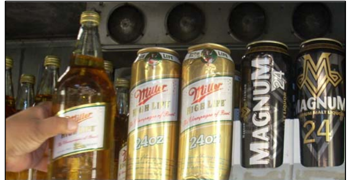
24 ounce cans of beer are the most common type of single-serve alcoholic beverages being sold in San Bernardino, but 32 and 40 ounce bottles are also found in many supermarkets and convenience stores.

Secondly, single-serve products are routinely offered for sale cold and ready to be consumed. This frequently