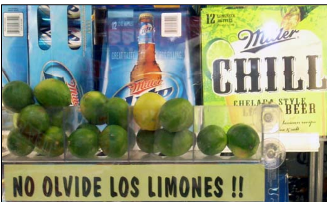
Since Hispanic customers prefer lemon with some types of beer, one San Bernardino store offers fresh lemons so that the product can be consumed immediately after purchase. (Sign reads: don't forget the lemons)

A 40 ounce bottle of malt liquor is equal to five shots of whiskey.